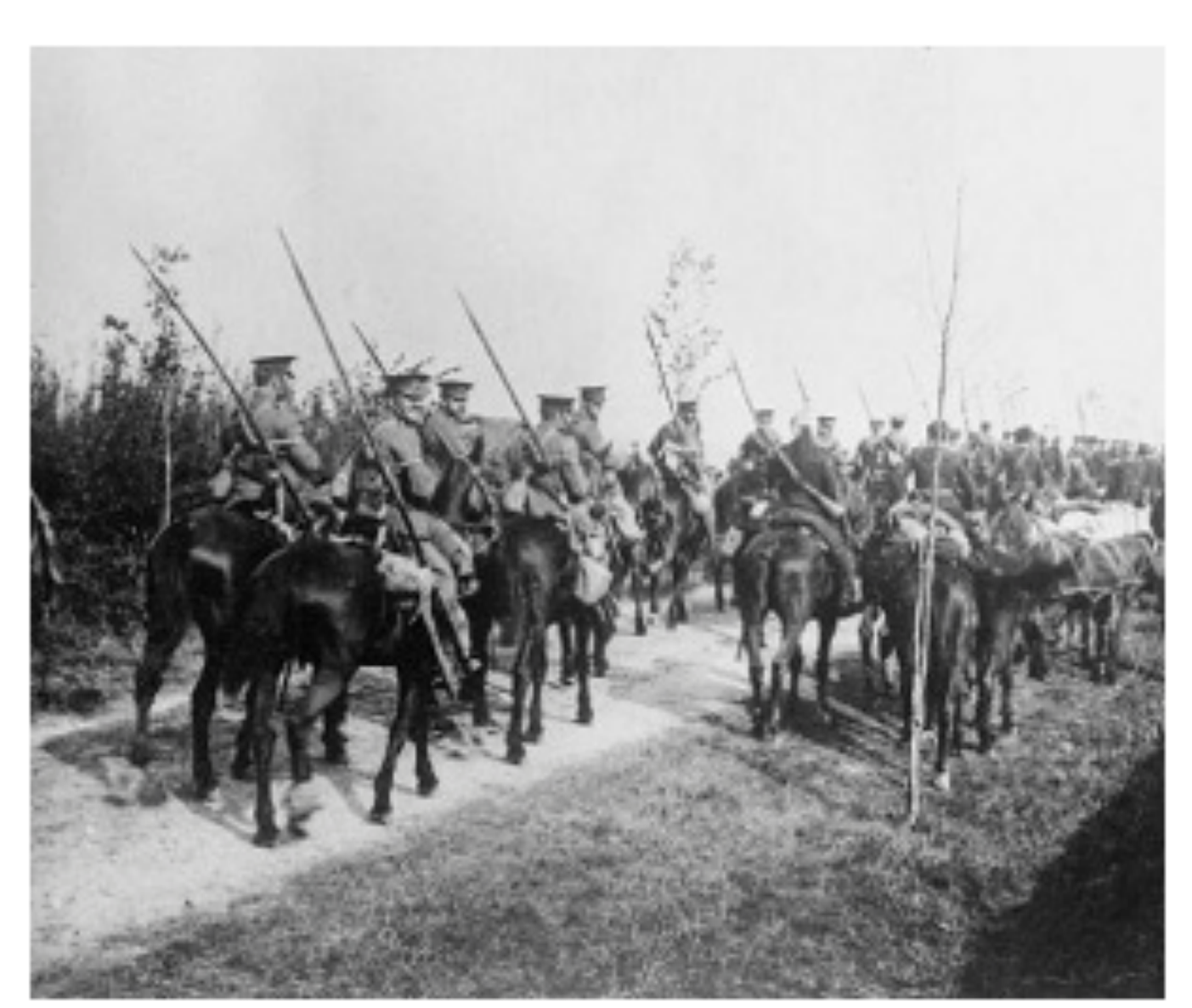
16th (The Queen's) Lancers on the march, September 1914. Image Q56309 courtesy of the Imperial War Museum.