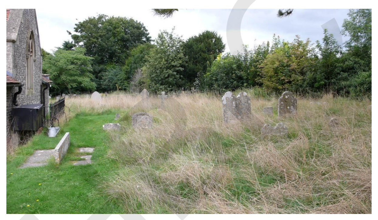
(3). Taller and denser grass sward behind the church

Parts of the churchyard are mown regularly, but this tends to be restricted to high traffic areas, with the majority of the rest of the site either subject to an annual hay cut regime, or are cut only occasionally.